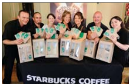
Starbucks customers voted on which local community project to support"

Rachel manages 10 Starbucks stores in Brighton and the surrounding area. She also has